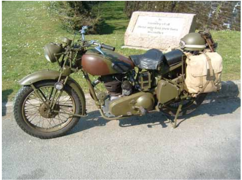
350 cc Royal Enfield WD/CO from 1942, used by the Home Guard for motorcycle reconnaissance and dispatch duties,

On Mendip between Banwell and Burrington Combe is a hill range which was a defended locality by the Home Guard. There were several rail and road routes which were seen as a strategic point of